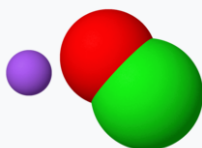
Sodium Hypochlorite (Bleach) NaClO